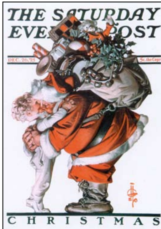
THE SATURDAY EVENING POST NORMAN ROCKWELL The Saturday Evening Post.