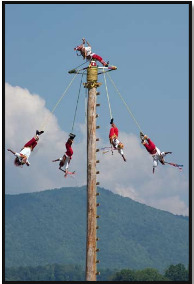
Los Voladores, Trade, TN, June 2005