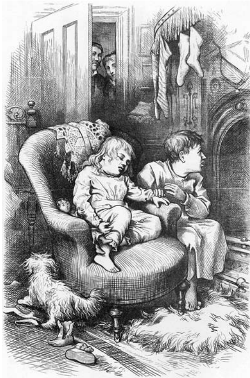
The Watch on Christmas Eve by Thomas Nast