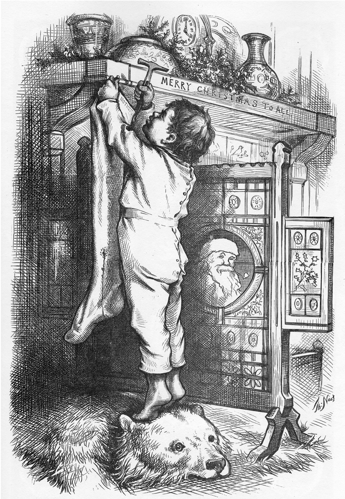
A Chance to Test Santa Claus' Generosity by Thomas Nast