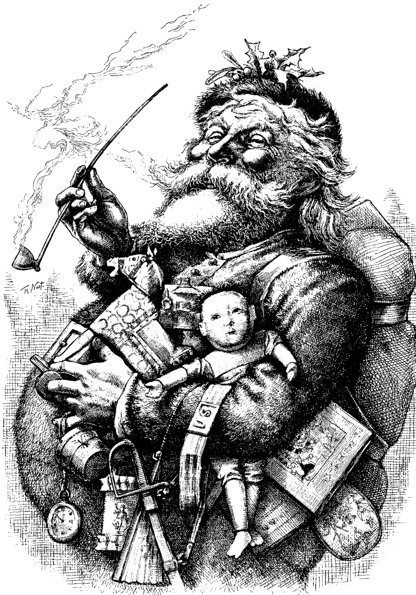
“Merry Old Santa Claus,” by Thomas Nast. From Harper’s Weekly , Jan 1, 1881.

“In putting on this suit and entering the sleigh, the wearer waives any and all rights to previous identity, real or implied, and fully accepts the duties and responsibilities of Santa Claus until such time that wearer becomes unable to do so either by accident or design.”