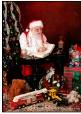
CONTRIBUTED PHOTO Santa Lou at his desk.